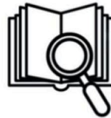
Global Scholarly Work